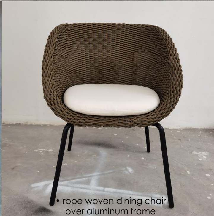
• rope woven dining chair over aluminum frame