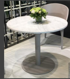
Other recommended pairing tables