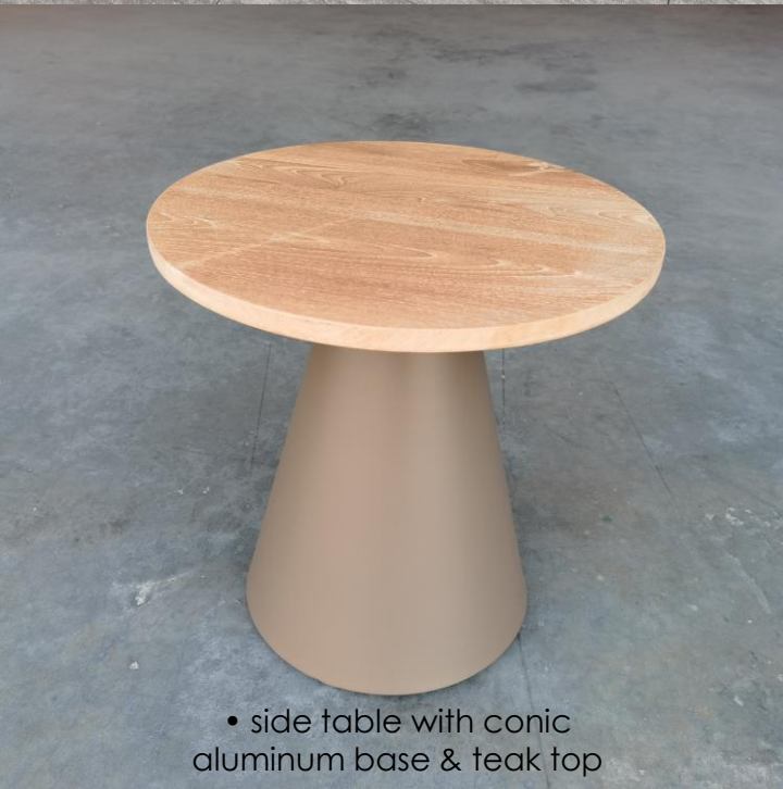
• side table with conic aluminum base & teak top