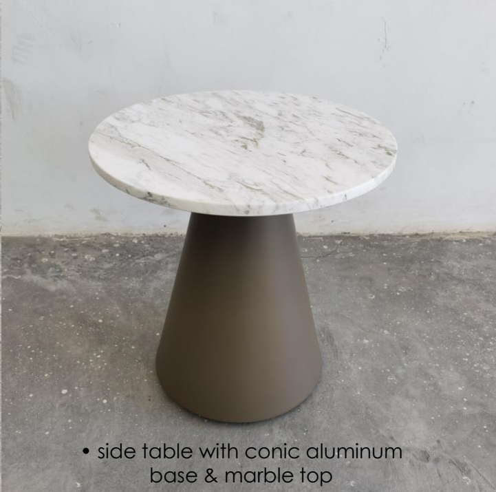
• side table with conic aluminum base & marble top