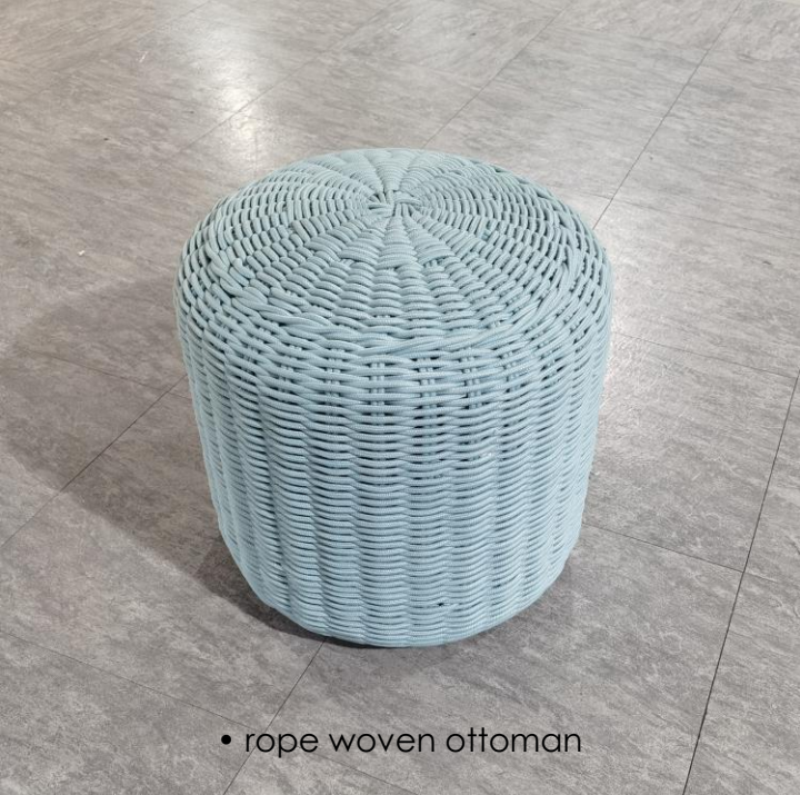
• rope woven ottoman